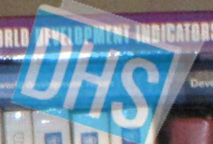
D. HIDALGO SCHNUR